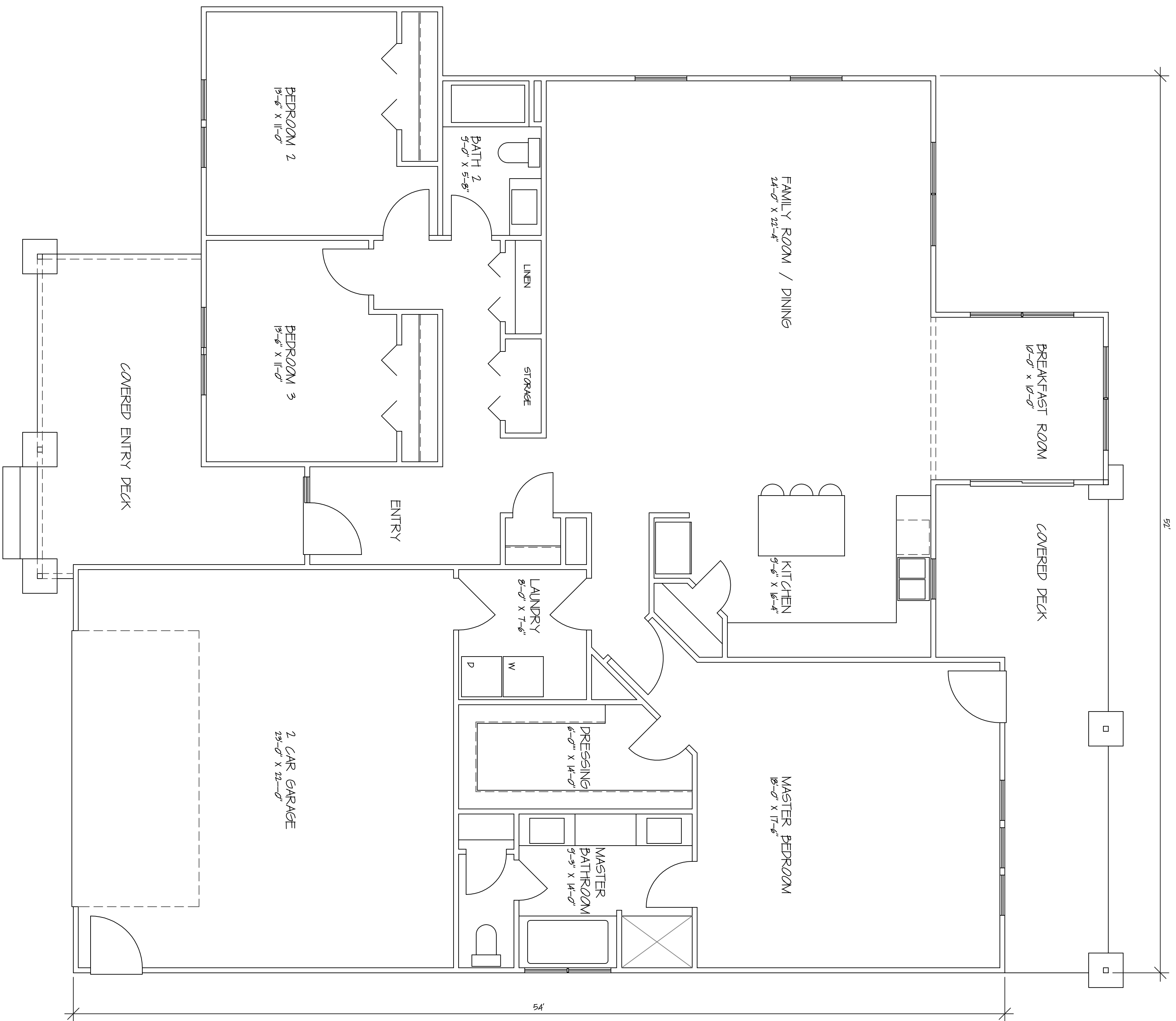
MAIN LEVEL FLOORPLAN